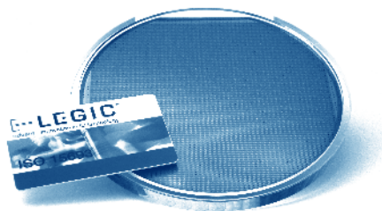
Wafer delivery form