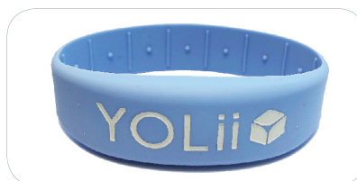
Logo Engraving with color filling