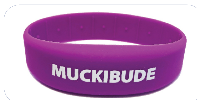
Logo Engraving with color filling